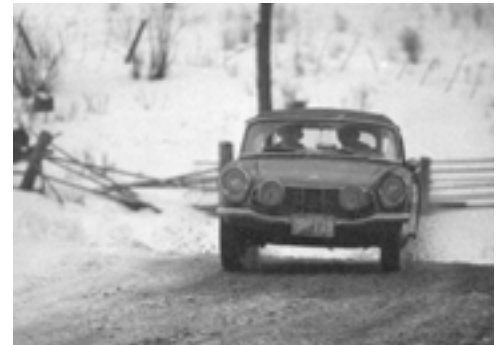
Dave Fairhall, Honda S600, on Mamette Lake Road, TBird 66